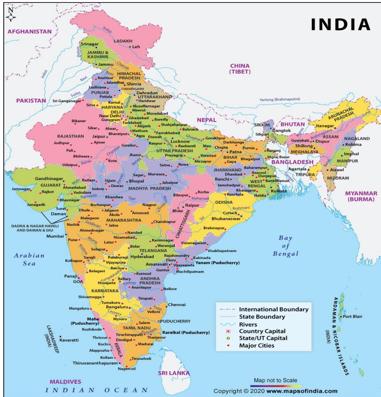
Map of India showing States and Union Territories and their Capital