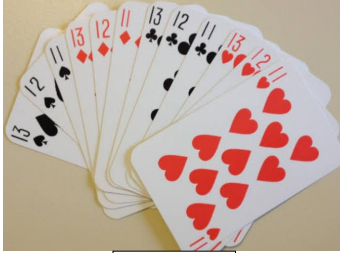
Deck of cards