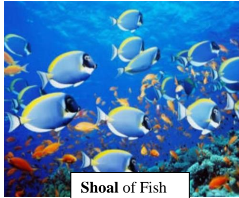
Shoal of Fish