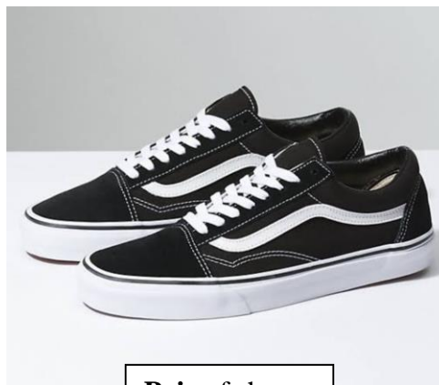
Pair of shoes

PT2 : Ch. – 5 Nouns: Singular and Plural