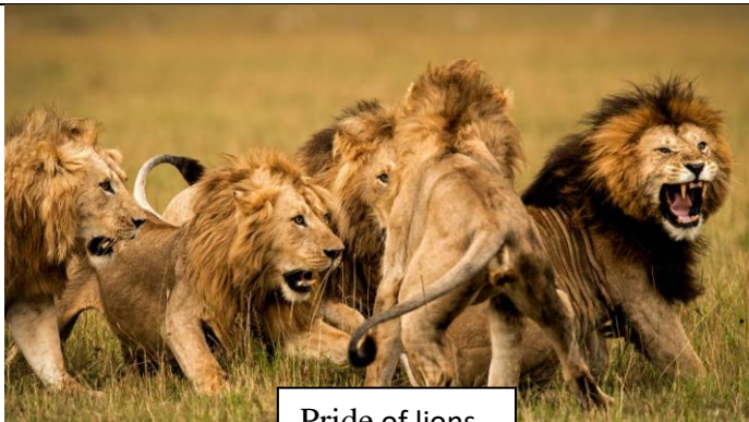
Pride of lions