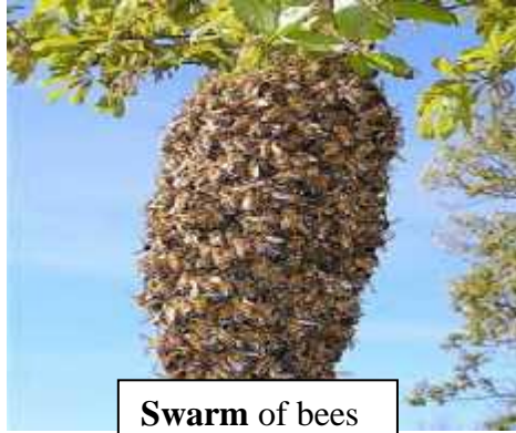
Swarm of bees